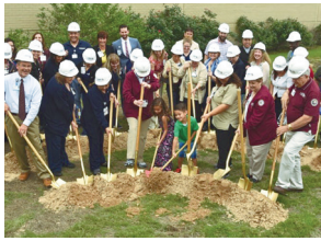
BREAKING NEW GROUND. Methodist Stone Oak Hospital is expanding. SEE PAGE 5 ►